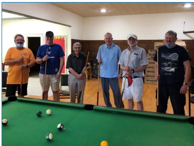
The Billiard Buddies meet Tuesdays at 12:30 and will continue to get together through the summer. All are welcome!